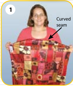
1 This is your unfolded sling.