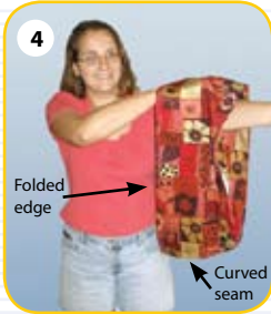
4 The curved seam should be down. Put your arm through, with the folded edge toward you.