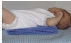
Place a thin folded receiving blanket in the sling from baby’s bottom to his shoulders.

For a tiny newborn, before putting the baby in, pull the inner rail high up on your chest to reduce the depth of the pouch. This will prevent the baby from sinking down too low in the sling.