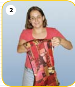
2 Find the curved seam.