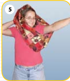
5 Put the sling over your head and rest it on your shoulder.