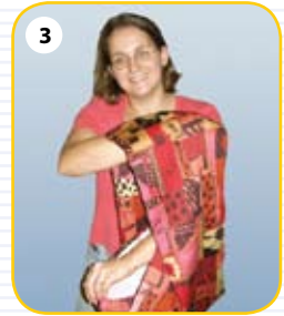
3 Fold your sling in on itself lengthwise to form a tube.